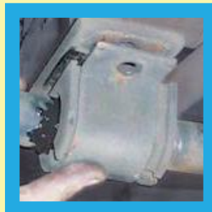
Anti-roll bar repairs on trucks and buses