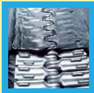
Clip joint sealing

Off-road tyre repair (quarry vehicles, tractors, diggers, graders, etc.), patch linings in chutes, tanks, pipes, and truck beds, mending rubber / polyurethane screen decks, rubber castings / mouldings, marine fender repairs, rubber lining, watertight sealing, vehicle anti-roll bar repair / rebuilding (buses, trucks etc.).