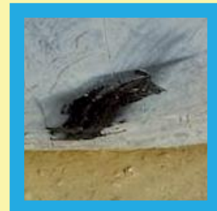
Off-road tyre repairs